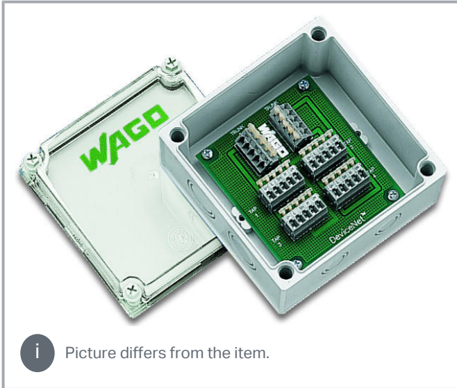
i Picture differs from the item.